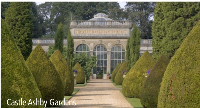
Castle Ashby Gardens