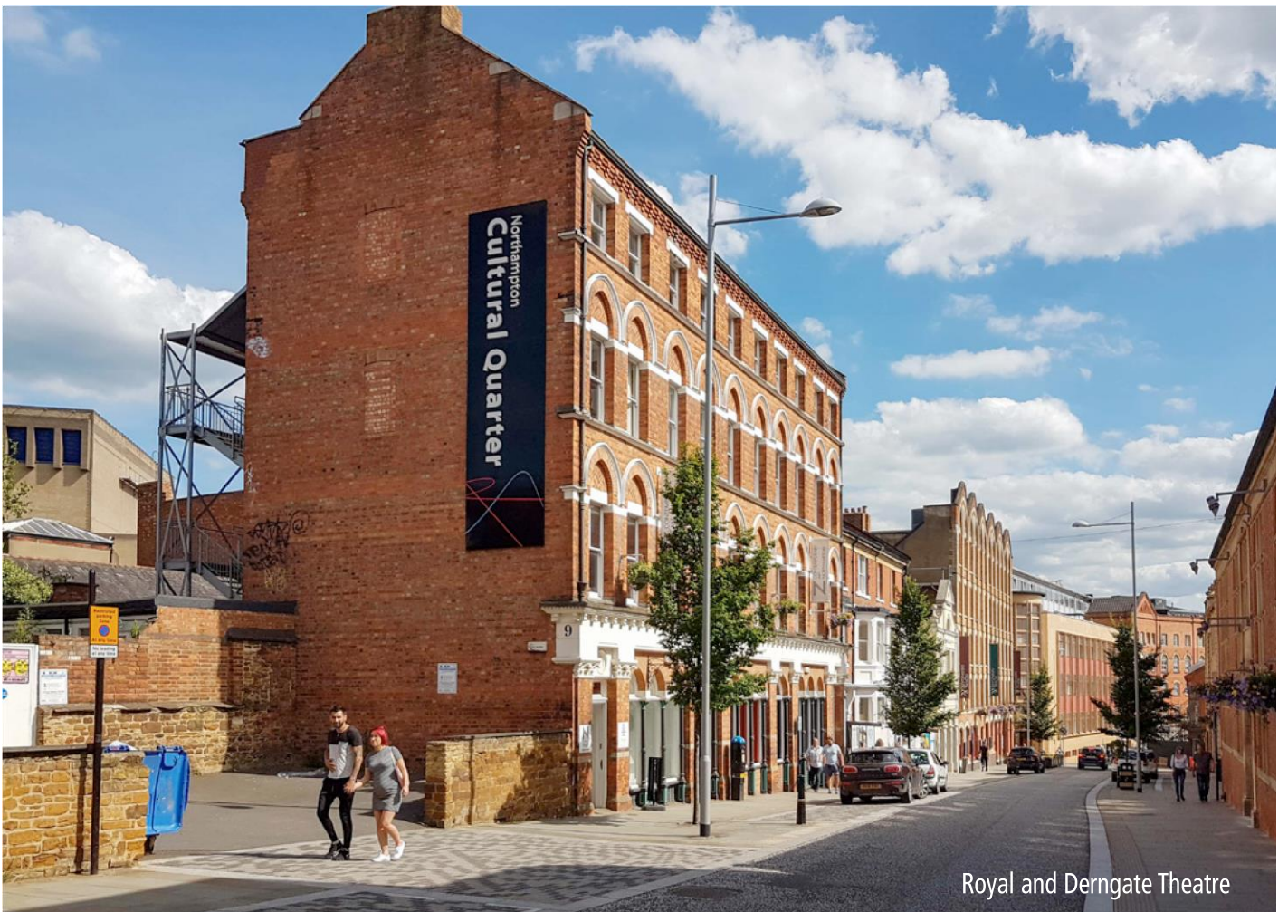
Royal and Derngate Theatre